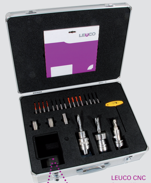
LEUCO CNC StarterKit